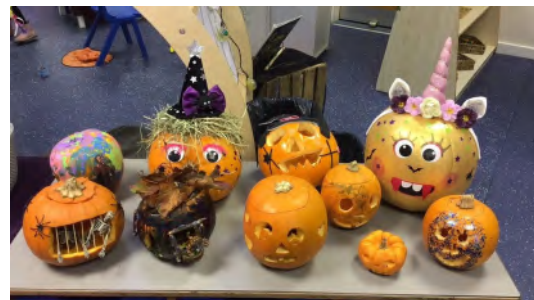
Pumpkin Decorating Competition