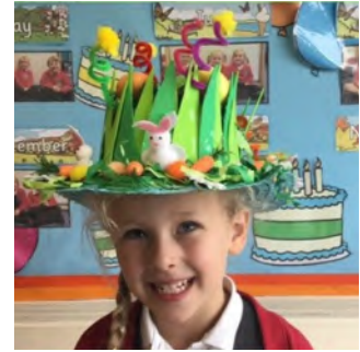
Easter Bonnet Parade

To become a member of FOGS or to find out more visit the website or contact FOGS@greetlandacademy.org.uk